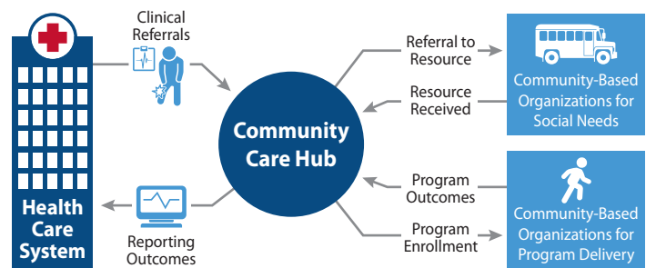
Figure 2: Iowa Community HUB Referral Pathways